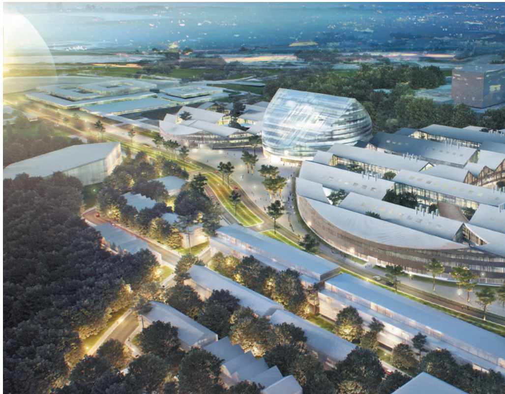
The Skolkovo Institute of Science and Technology will open near Moscow next year (artist’s impression).